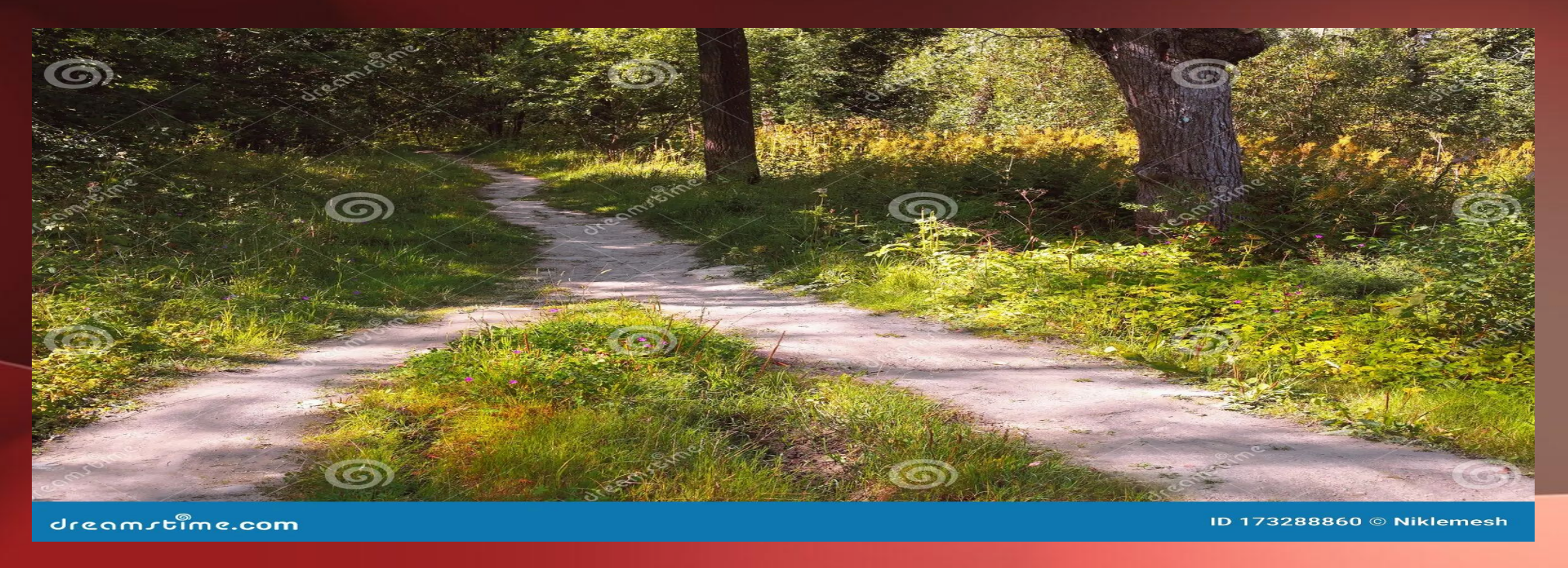
Two Paths... One Goal Excellence in Court Reporting